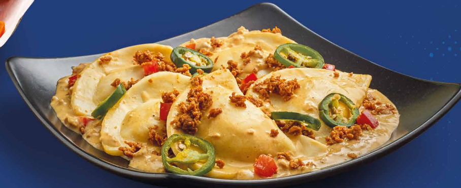
Creamy Jalapeño & Chorizo Pierogies