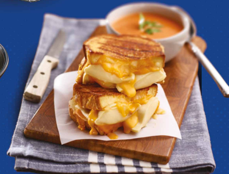
Pierogy Grilled Cheese