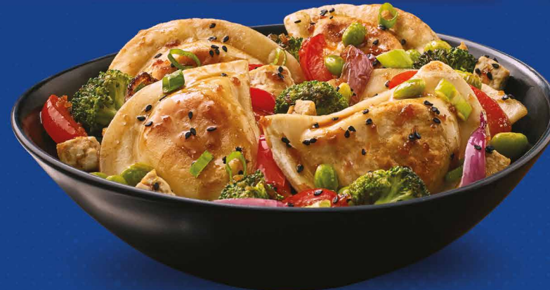
Sesame Ginger Pierogy Bowl